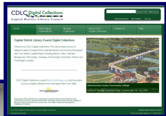
CDLC Digital Collections