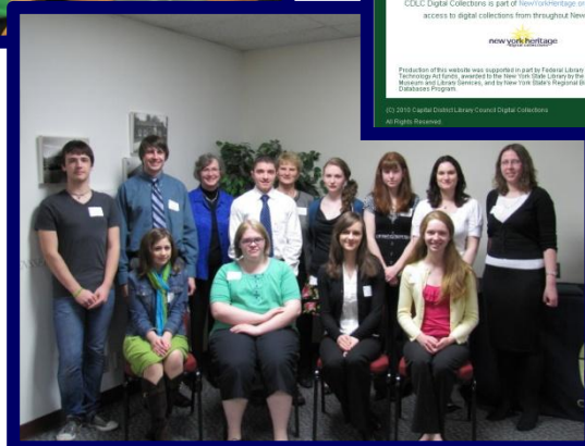
2010 Student Awards